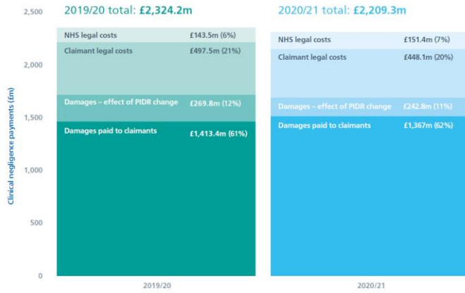
Figure 6: Clinical negligence payments for 2020/21 (including PIDR and expenditure related to CNSGP, ELSGP and ELGP)